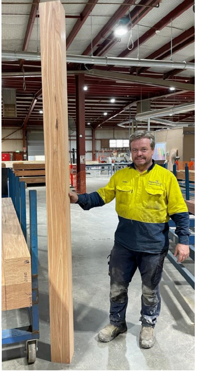
3RT Post and Beams Components Version 1.1 / November 2023